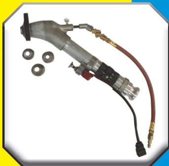
P/N 10-127/V Pole Gun