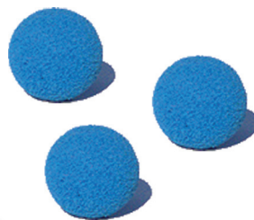
P/N 15-020 Ball Cleaning Kit