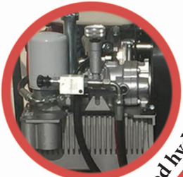
Adjustable speed hydraulic system