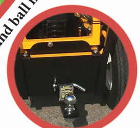
Hitch and ball mount