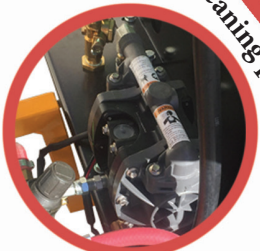
Solvent cleaning pump system