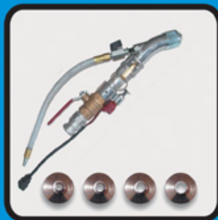
P/N 10-127/19 Short Pole Gun Include 4 Spray Tips.