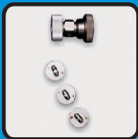
P/N 10-050 Fine Finish Spray Tips For Gun P/N 10-311/19.