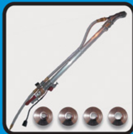
P/N 10-128/19 3' Pole Gun P/N 10-129/19 5' Pole Gun Include 4 Spray Tips.