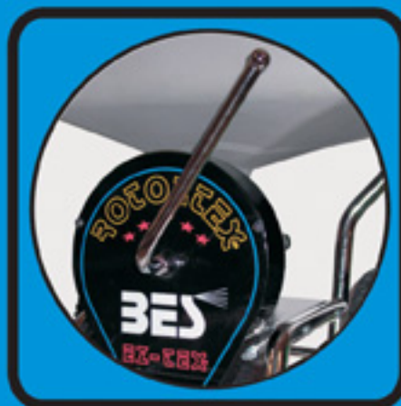
P/N 19-060 Socket With Handle To Free Locking Rotor.