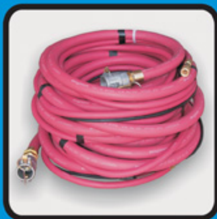
P/N 19-071 Additional 50' Material Hose Set.