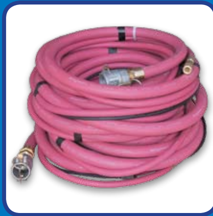
P/N 19-071 Additional 50' Material Hose Set