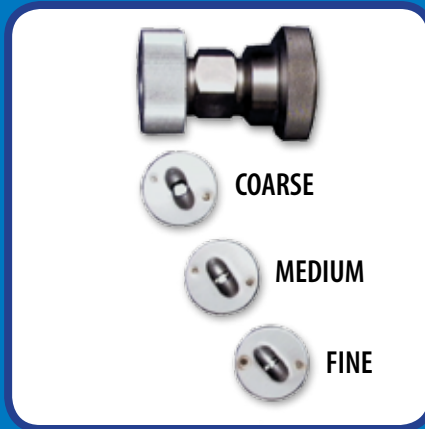
P/N10-050 Fine Finish Spray Tips For Gun P/N 10-311/19