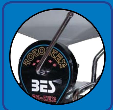
P/N 19-060 Socket With Handle To Free Locking Rotor