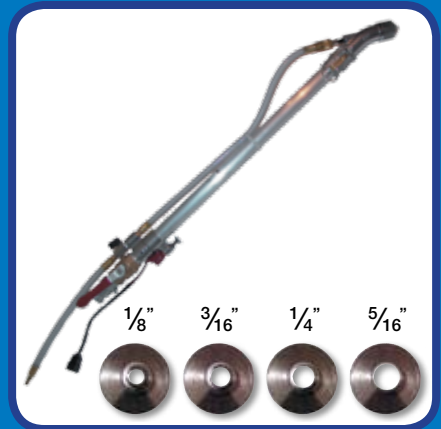
P/N 10-128/19 – 3' Pole Gun P/N 10-129/19 – 5' Pole Gun Include 4 Spray Tips