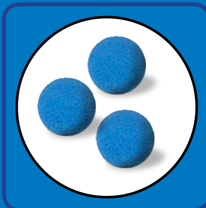
P/N 15-020 Cleaning Balls