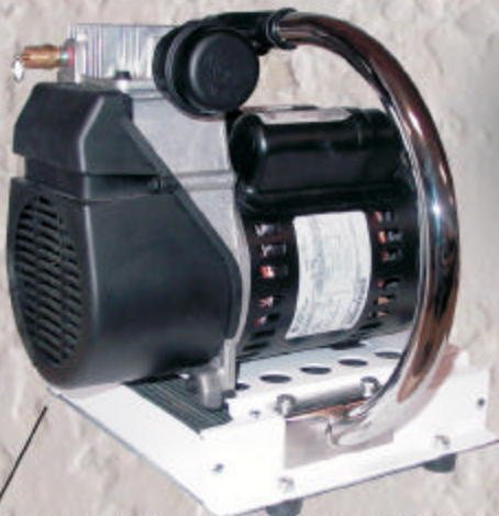
Optional electric conversion power compressor. Not included with standard XTC-10 Unit