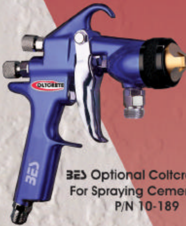
Optional Coltcrete Gun Kit For Spraying Cement Like Paint P/N 10-189