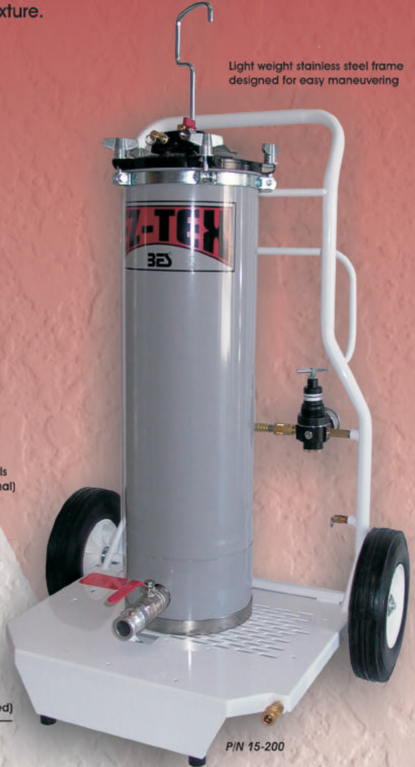
Light weight stainless steel frame designed for easy maneuvering