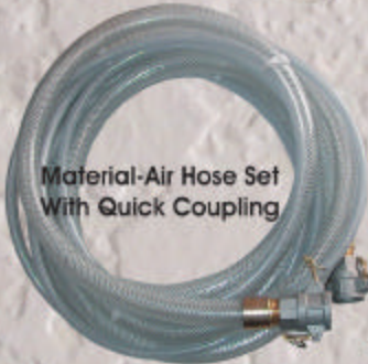
Material-Air Hose Set With Quick Coupling