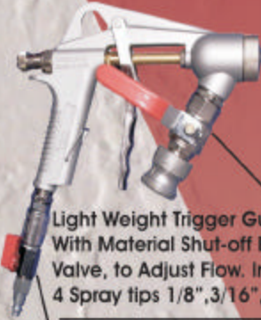
Light Weight Trigger Gun With Material Shut-off Ball Valve, to Adjust Flow. Includes 4 Spray tips 1/8", 3/16", 1/4" 5/16"